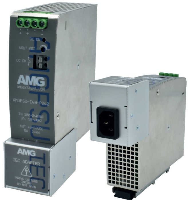
[ AMGPSU-I48-P240-IEC ]

AMG's industrial DIN-Rail 240W power supplies provide reliable power for AMG PoE based products and ensure stable equipment operation over a wide temperature range. They are suitable for all AMG PoE products (depending on voltage).